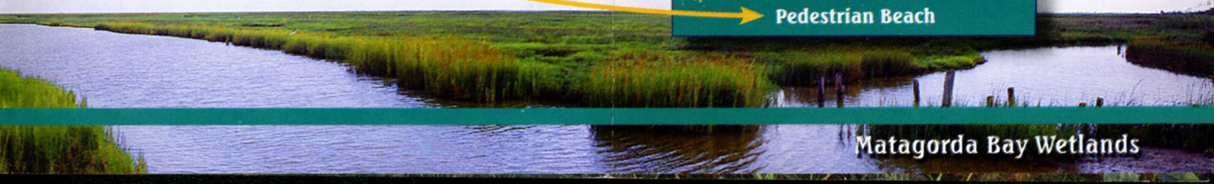
Matagorda Bay Wetlands